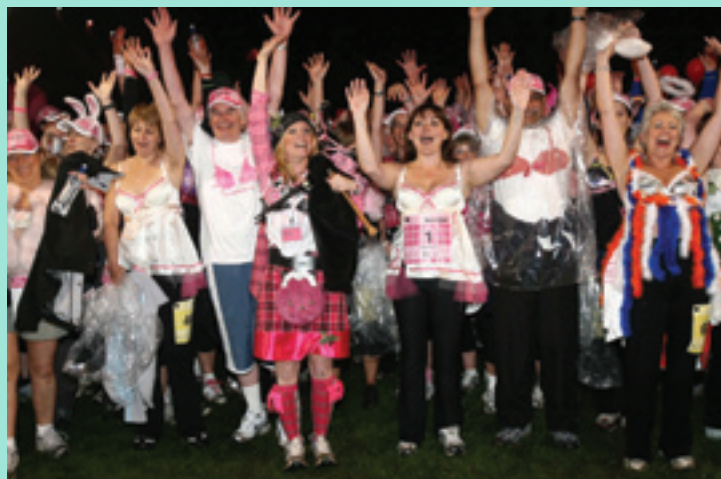
Ready to start the Edinburgh MoonWalk